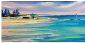
Cool Waves City Beach-oil on canvas 126 x 65cm