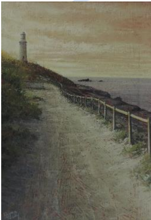
BLUE SECTION RUNNER UP: Glynis Lumley